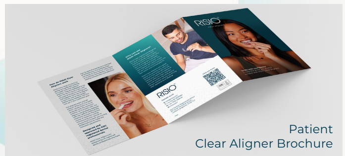
Patient Clear Aligner Brochure