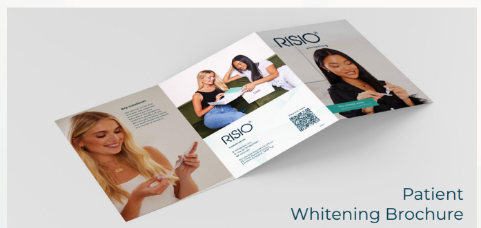
Patient Whitening Brochure