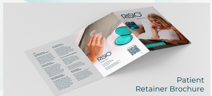
Patient Retainer Brochure